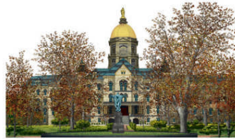
University of Notre Dame, South Bend, IN

The University of Notre Dame ranks among the top five NCAA Division I institutions in the country in combining athletic and academic achievement, according to the annual rankings released Monday by the National Collegiate Scouting Association in Chicago.